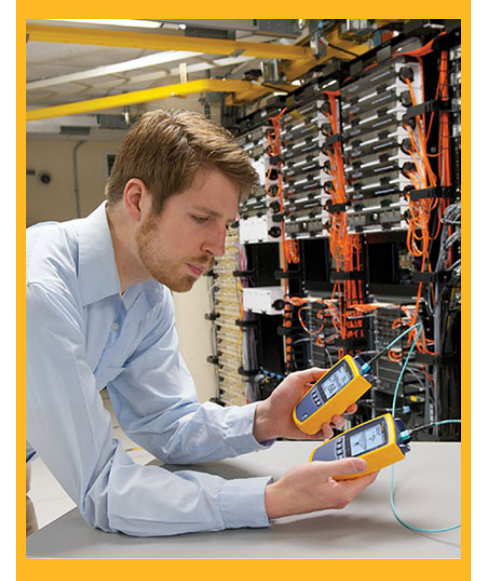
First MPO tester to support both Singlemode and Multimode MPO fiber testing

Pre-terminated fiber cables are manufactured and tested to comply with ANSI/TIA and international standards. When these cables are installed many factors can potentially impact performance. Field testing is the only way to ensure that pre-terminated fiber is installed to meet the application performance requirements. With single and duplex testers this verification testing is a time-consuming, manual and imprecise process. To ensure installation is done to standards, test with the MultiFiber Pro.